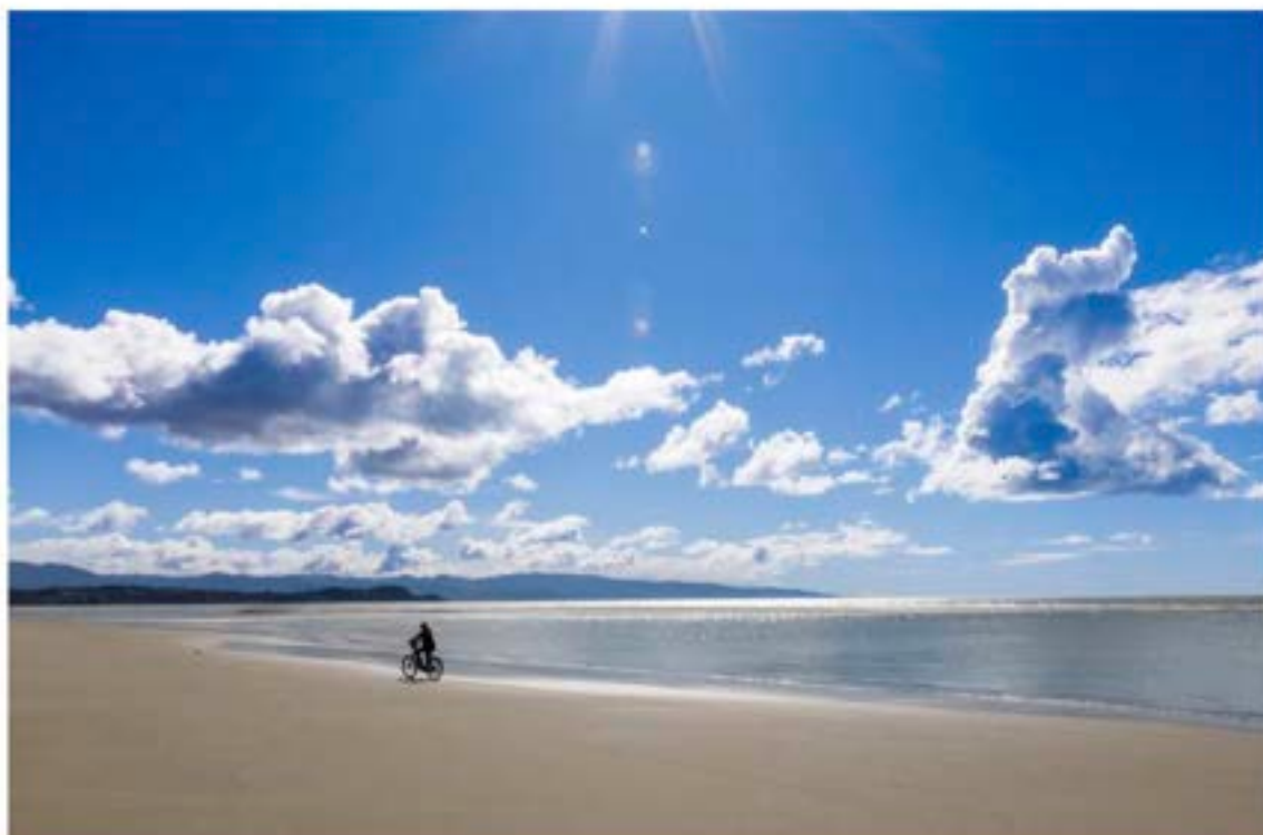
Rabbit Island's coastal track leads to undisturbed sand as far as the eye could see, perfect to explore on an e-bike on a sunny day.